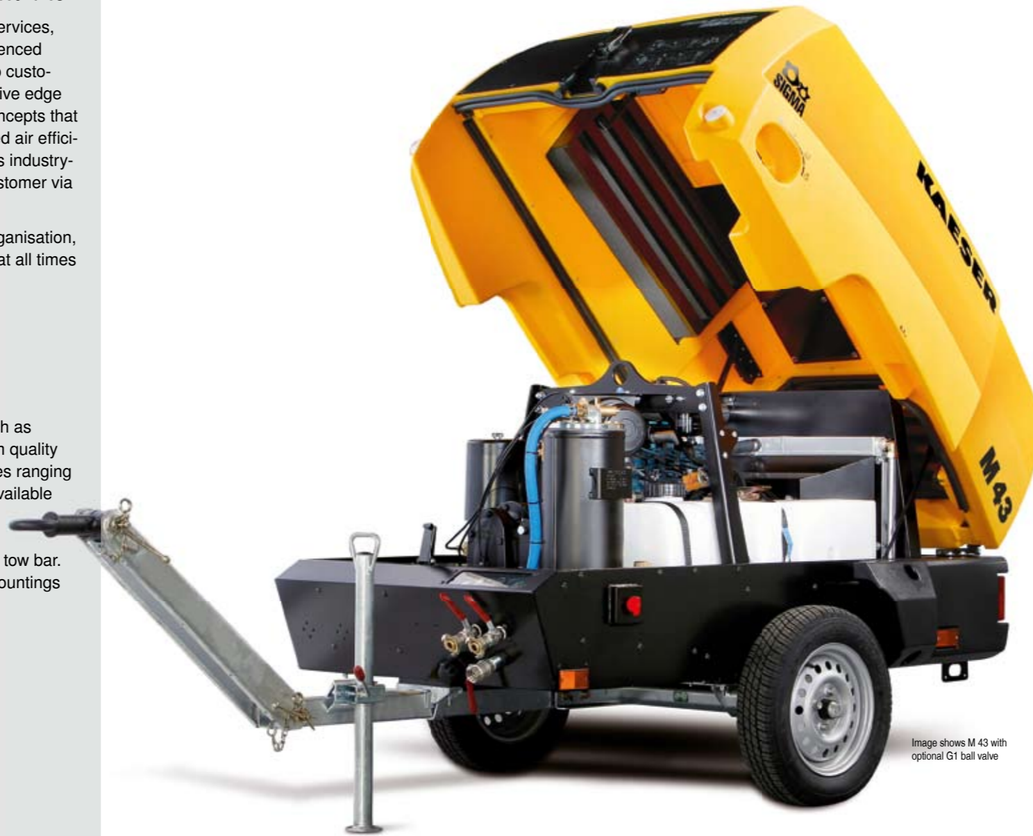
Image shows M 43 with optional G1 ball valve